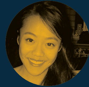
Nicole Zhu Digital Shop

The physical expression of light and the passage of time is the core of our design. Our design reconsiders the light switch by representing the immateriality of light as a tangible object that can be held by the user, allowing them to visualize and contemplate their daily use of light over time. The light is turned on by inserting pegs into a subtle opening embedded in the wall, and the duration and brightness of the light are determined by the length of the insertion and the weight of the peg. Over time, the peg slowly moves out of the opening, and eventually switches off the light.