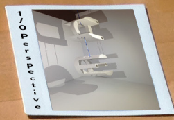
1000 S C E N E S