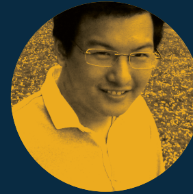
Chong Ying Pai Environments Design