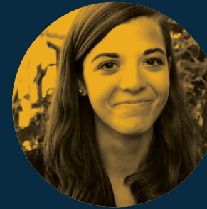
Megan Crabtree Digital Shop