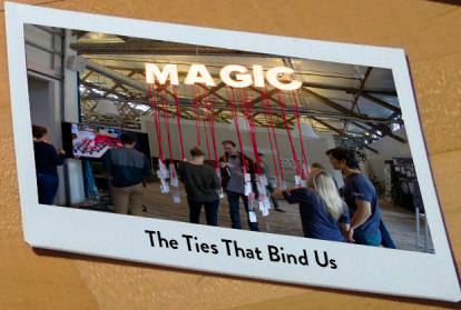
The Ties That Bind Us