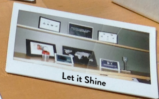
Let it Shine