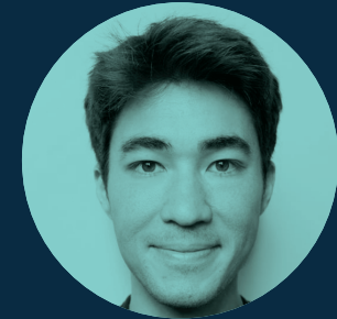
Sasha Urano Environments

Smile Switch is a collaborative game that converts your facial expressions into light. It tells you when to smile and when not to, and glows brighter if you are able to keep up. Find a partner and see how much light you can generate!