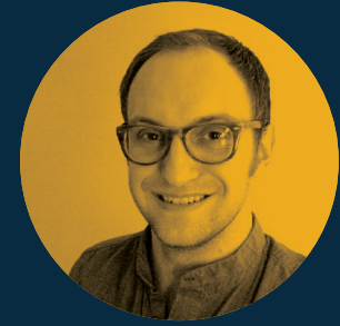
Aaron Soloway Digital Shop

“If you change the way you look at things, the things you look at change.” – Wayne Dyer