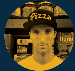
Sam Starr Wildcard

The Shift Switch offers a satisfying and easy-to-find switch-action, incorporating a bellows with mulch-directional movement. Basic functionality involves a simple on-off push-button effect, while more advanced features could include color spectrum 'tuning' for Phillips LED color bulbs in addition to a dimmer based on compression force.